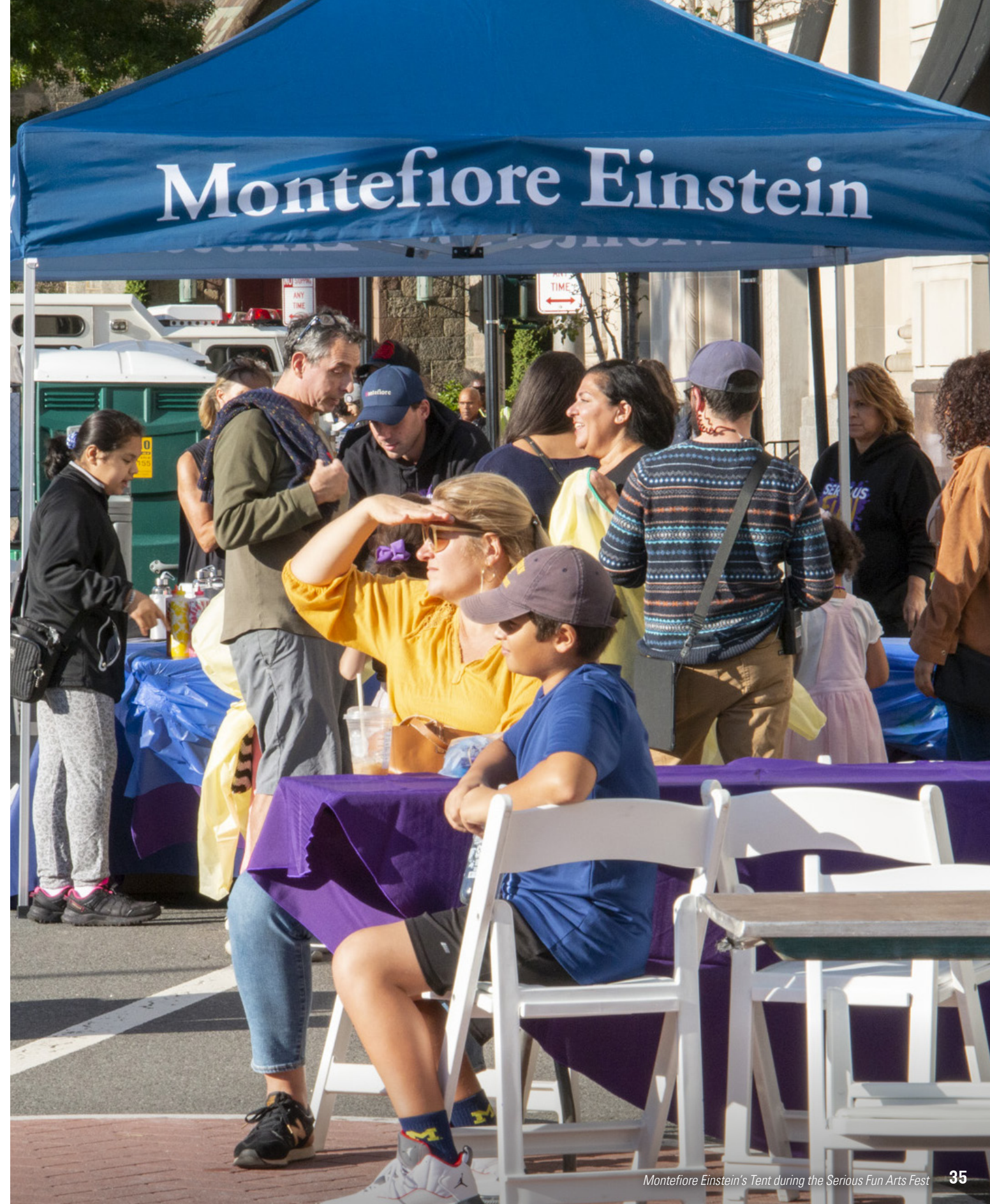
Montefiore Einstein's Tent during the Serious Fun Arts Fest