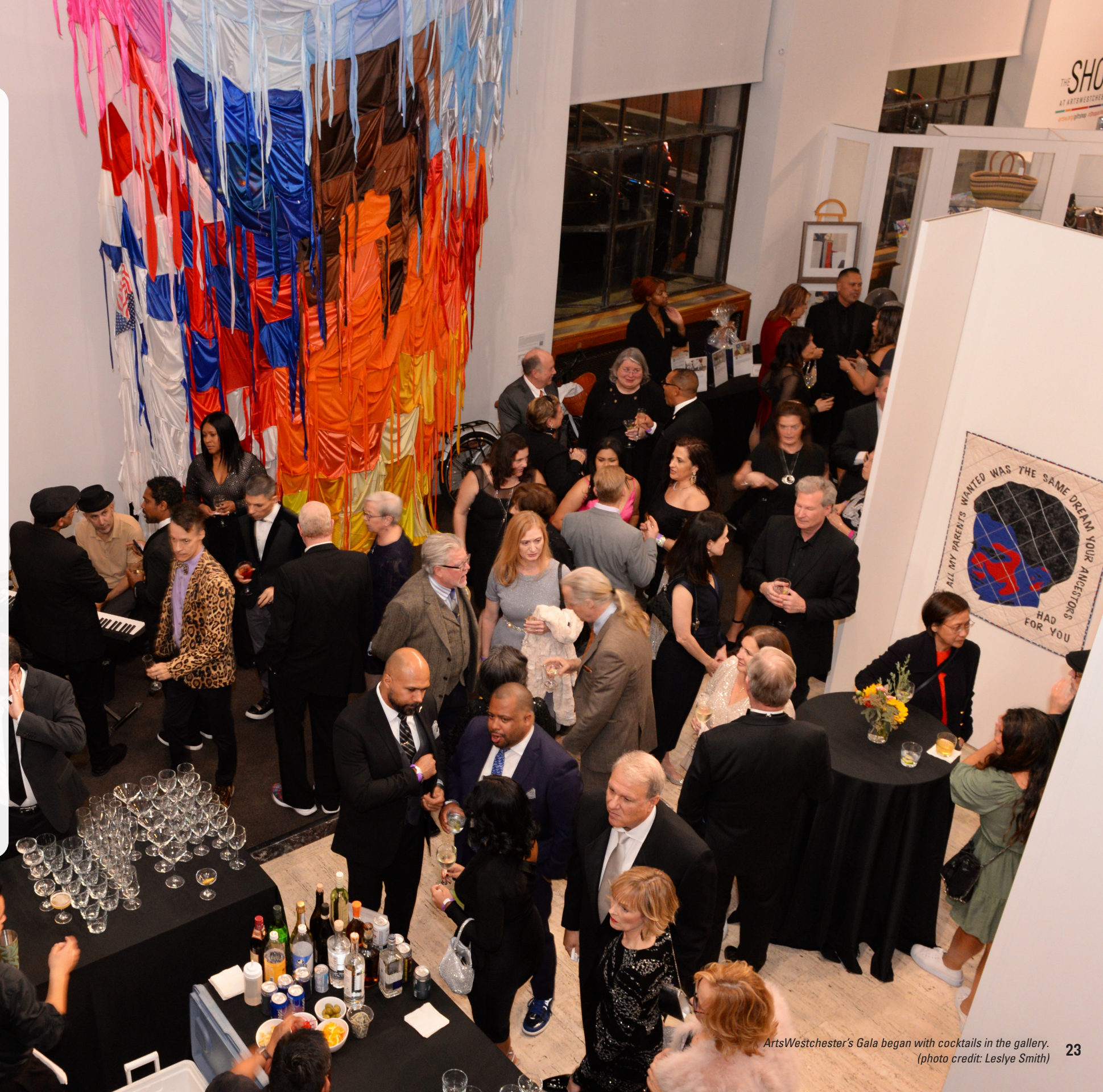
ArtsWestchester’s Gala began with cocktails in the gallery.

Building on the excitement of the Serious Fun Arts Fest held in October, ArtsWestchester’s annual gala became the culminating event of the festival, named as the Serious Fun Gala. In 2022, ArtsWestchester decided to bring the gala home to its gallery, where an outstanding exhibition served as a backdrop for the gala’s cocktail hour and an adjacent former restaurant served as a pop-up venue for a festive dinner. Beams of Hollywood lights lit the sky as guests, led by a local dance group, followed a red carpet to dinner under a monumental fabric sculpture by Amanda Browder displayed on the façade of ArtsWestchester’s building. Gala success is always the result of teamwork by staff and volunteers, and support from the Board – and 2022 was no different!