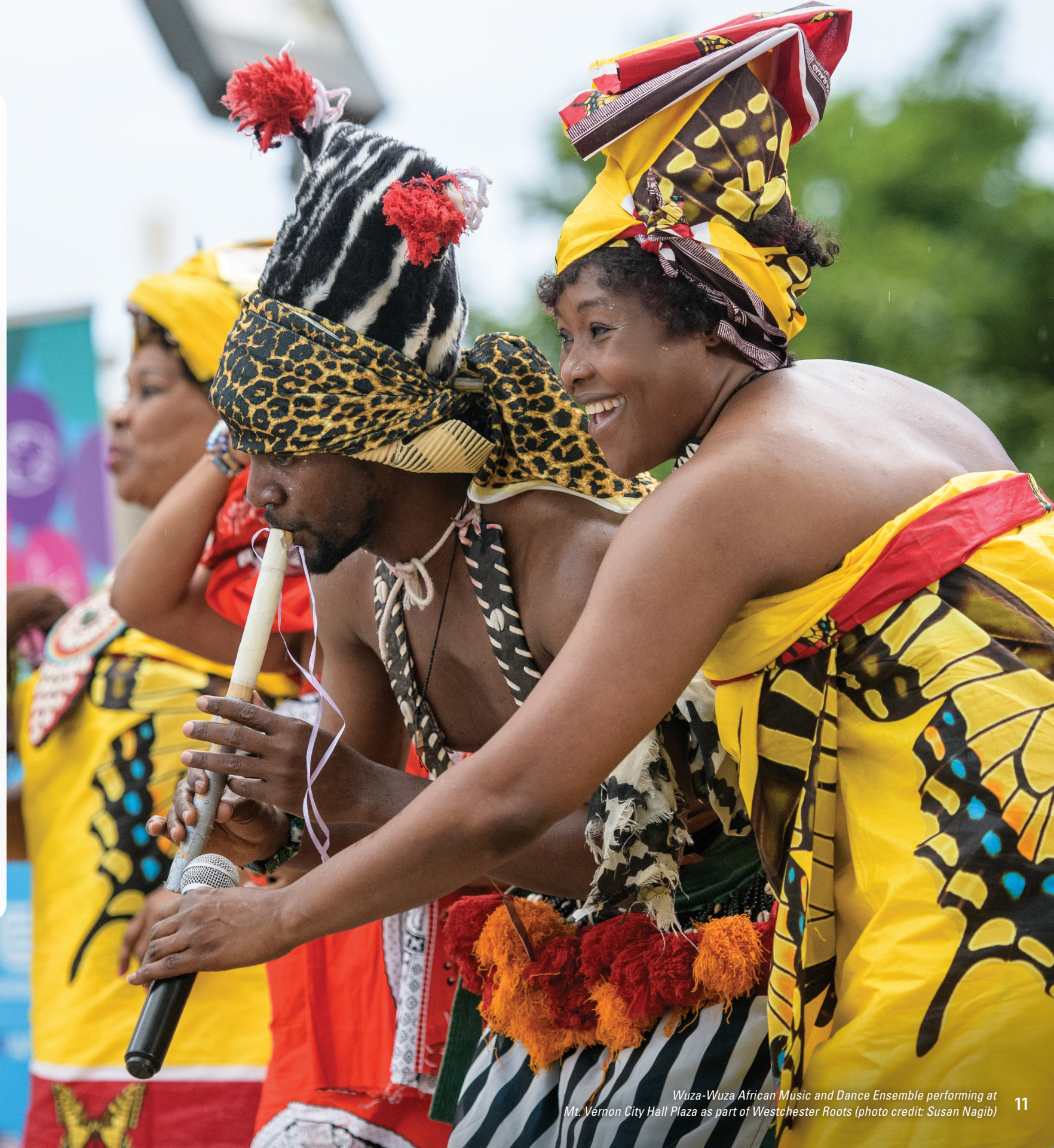
Wuzu-Wuzu African Music and Dance Ensemble performing at Mt. Vernon City Hall Plaza as part of Westchester Roots

enriches the local environment, building community pride and establishing a sense of place.