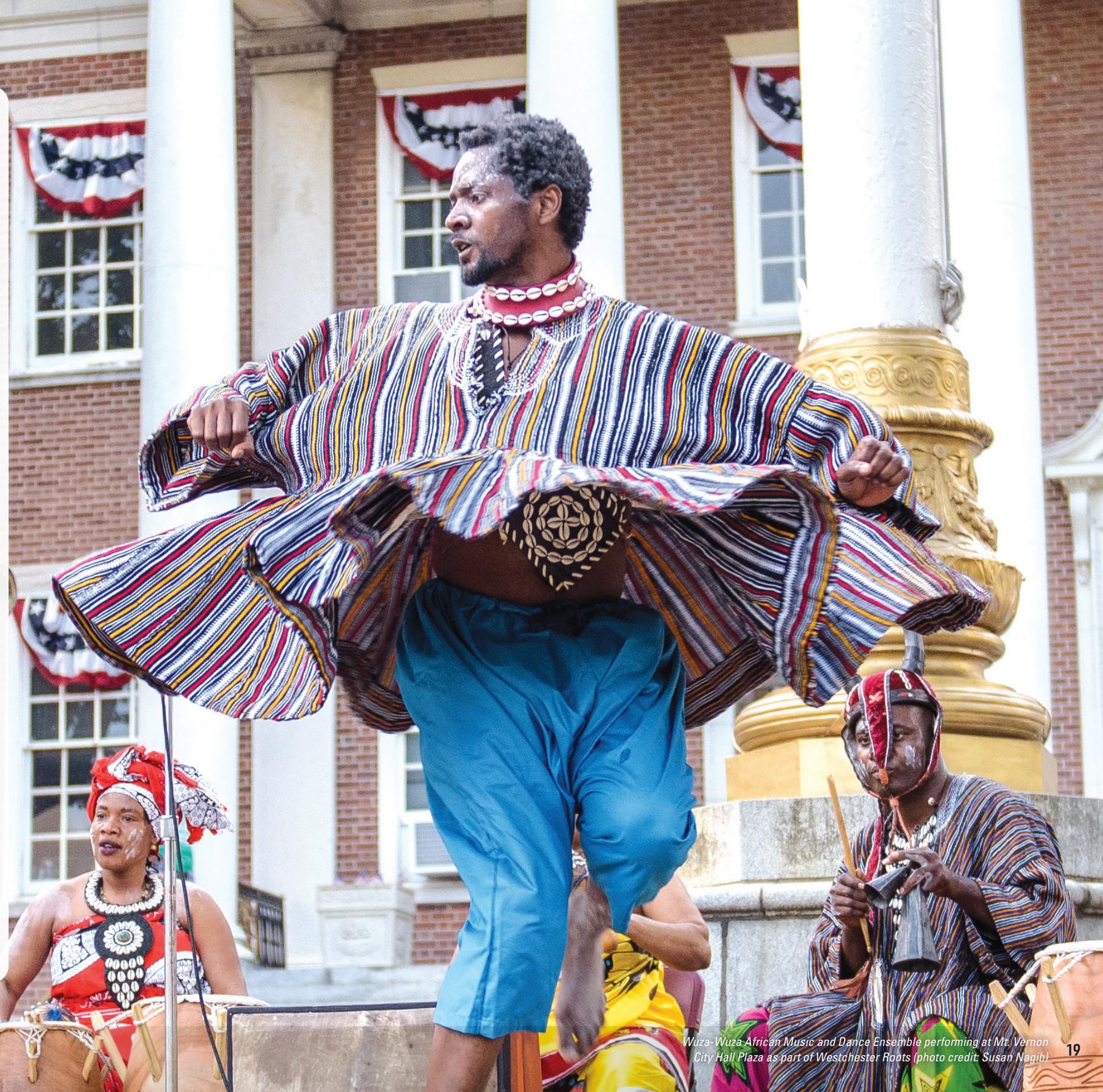
Wuzu-Afuzu African Music and Dance Ensemble performing at Mt. Vernon City Hall Plaza as part of Westchester Roots